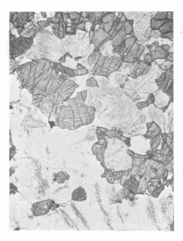
AUSTRALASIAN ANTARCTIC EXPEDITION.