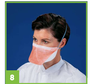
8 Position the remaining headband on the crown of your head.