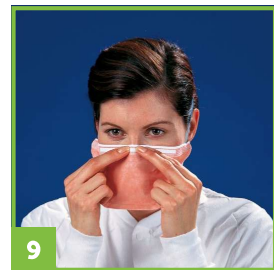
9 Conform the nosepiece across the bridge of your nose by firmly pressing down with your fingers.