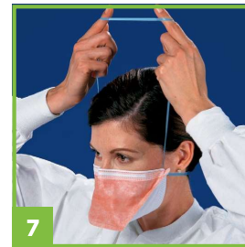
7 Release the lower headband from your thumbs and position it at the base of your neck.