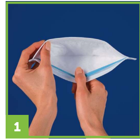
1 Separate the edges of the respirator to fully open it.

KNOWLEDGE NETWORK* Accredited Education In-Service Training and Technical Support Credentialed Sales Representatives Tools & Best Practices Clinical Research Commitment to Excellence