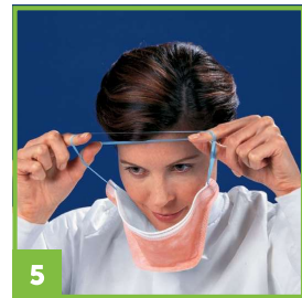
5 While holding the headbands with your index fingers and thumbs, cup the respirator under your chin.