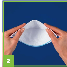
2 Slightly bend the nose wire to form a gentle curve.