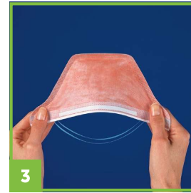
3 Hold the respirator upside down to expose the two headbands.