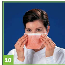
10 Continue to adjust the respirator and secure the edges until you feel you have achieved a good facial fit. Now, perform a user seal check.