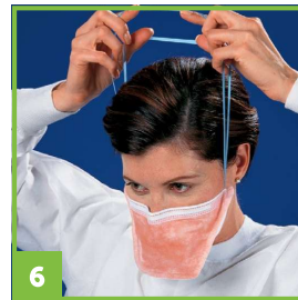
6 Pull the headbands up over your head.