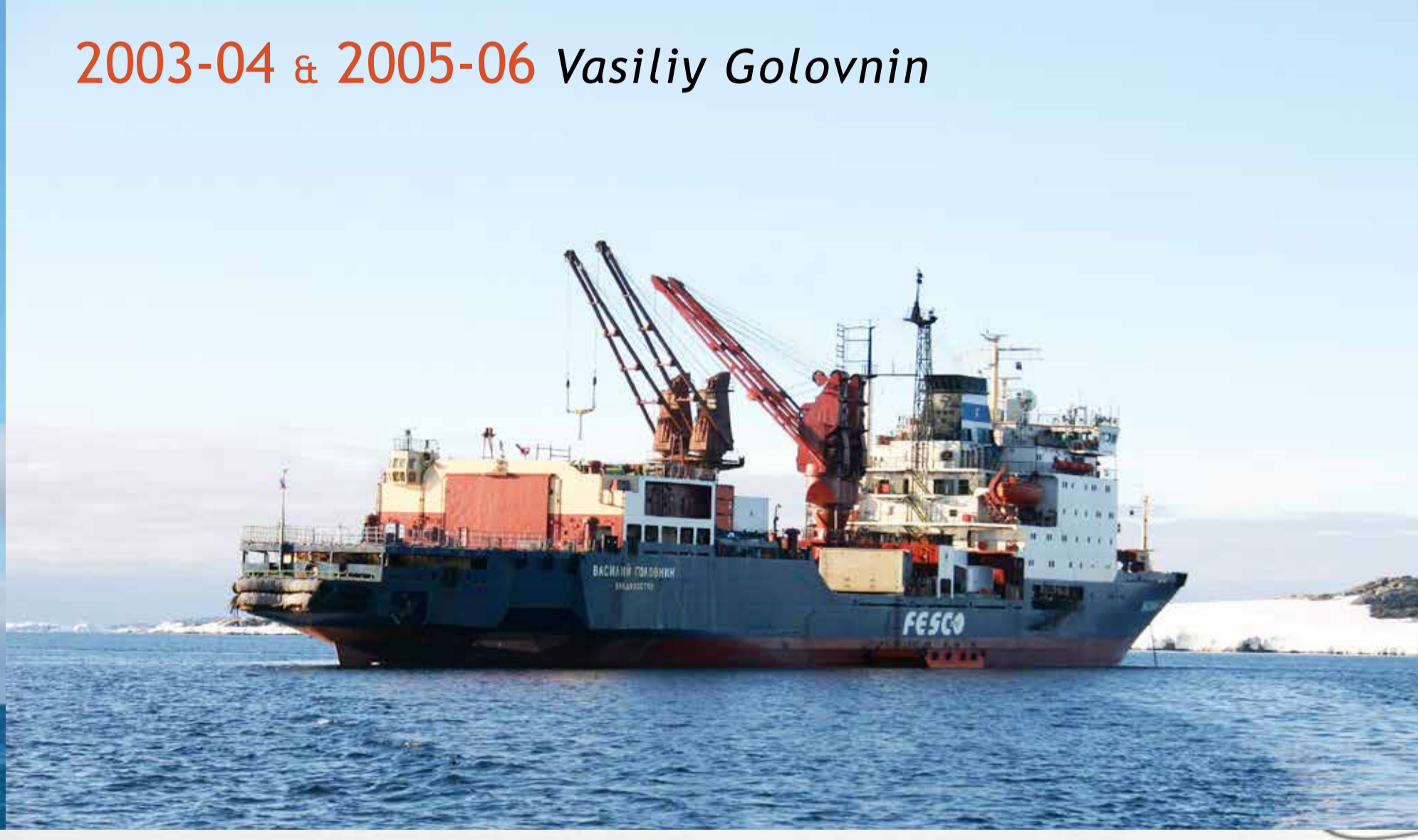
2003-04 & 2005-06 Vasily Golovnin