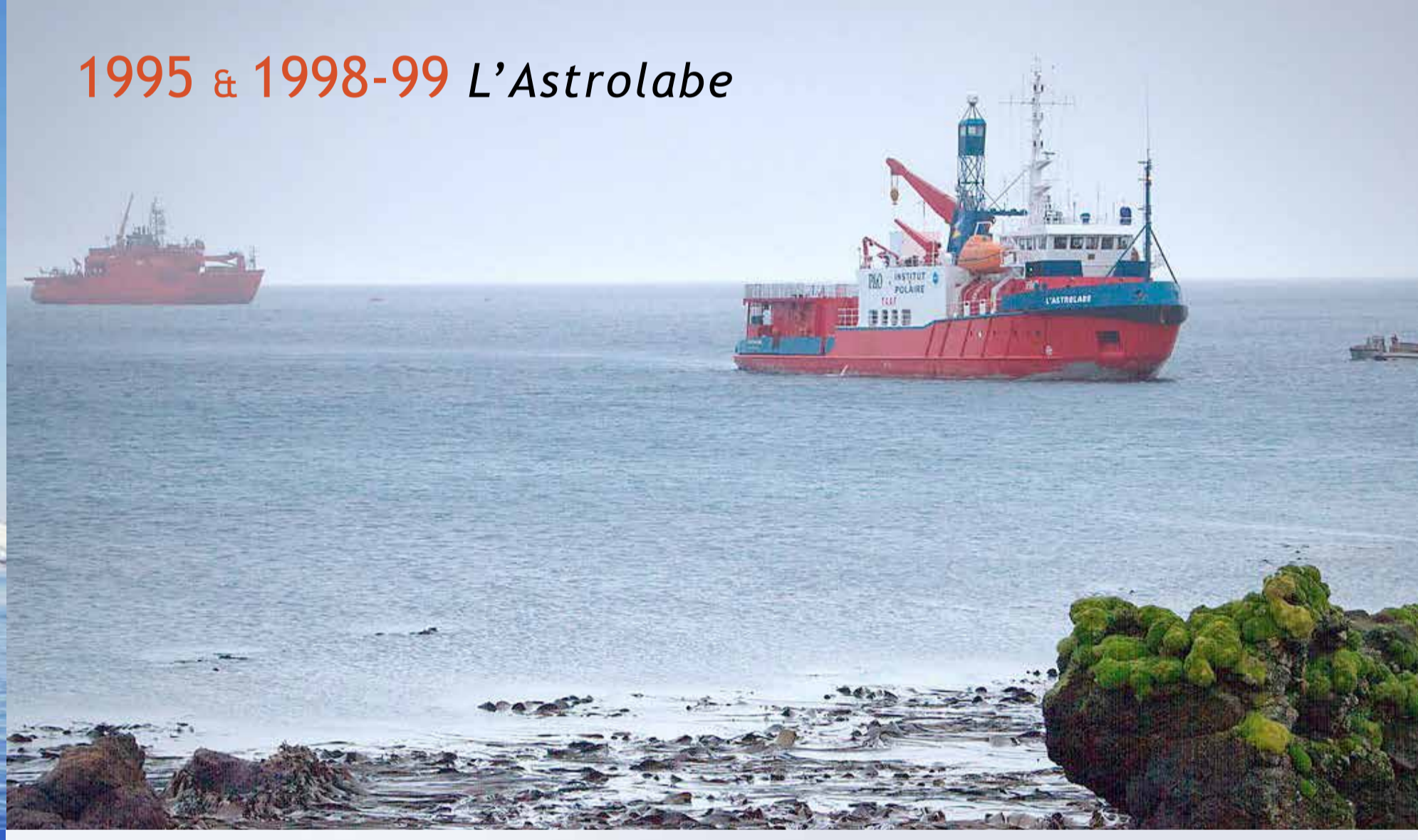
1995 & 1998-99 L'Astrolabe