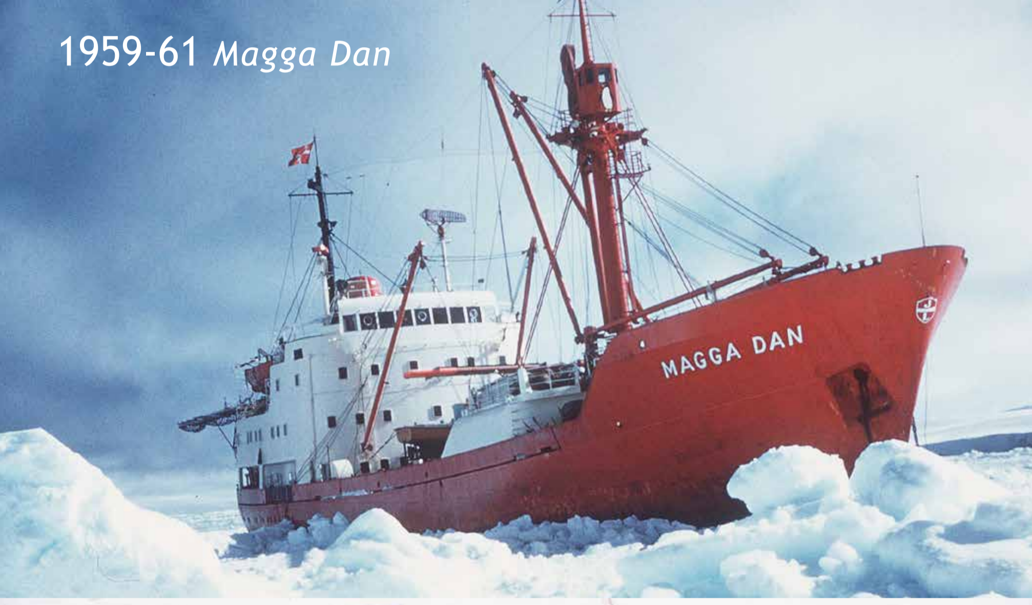
1959-61 Magga Dan