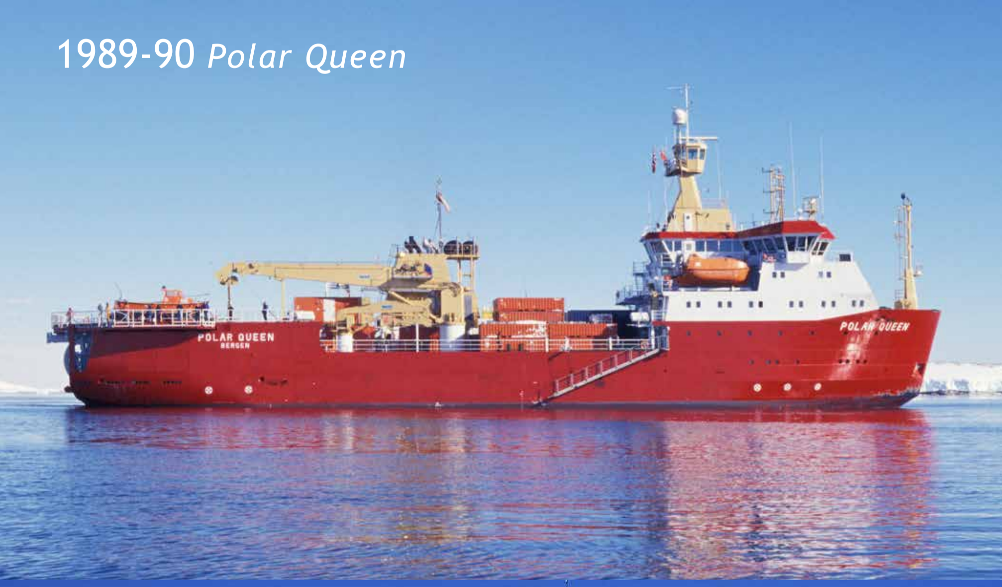
1989-90 Polar Queen