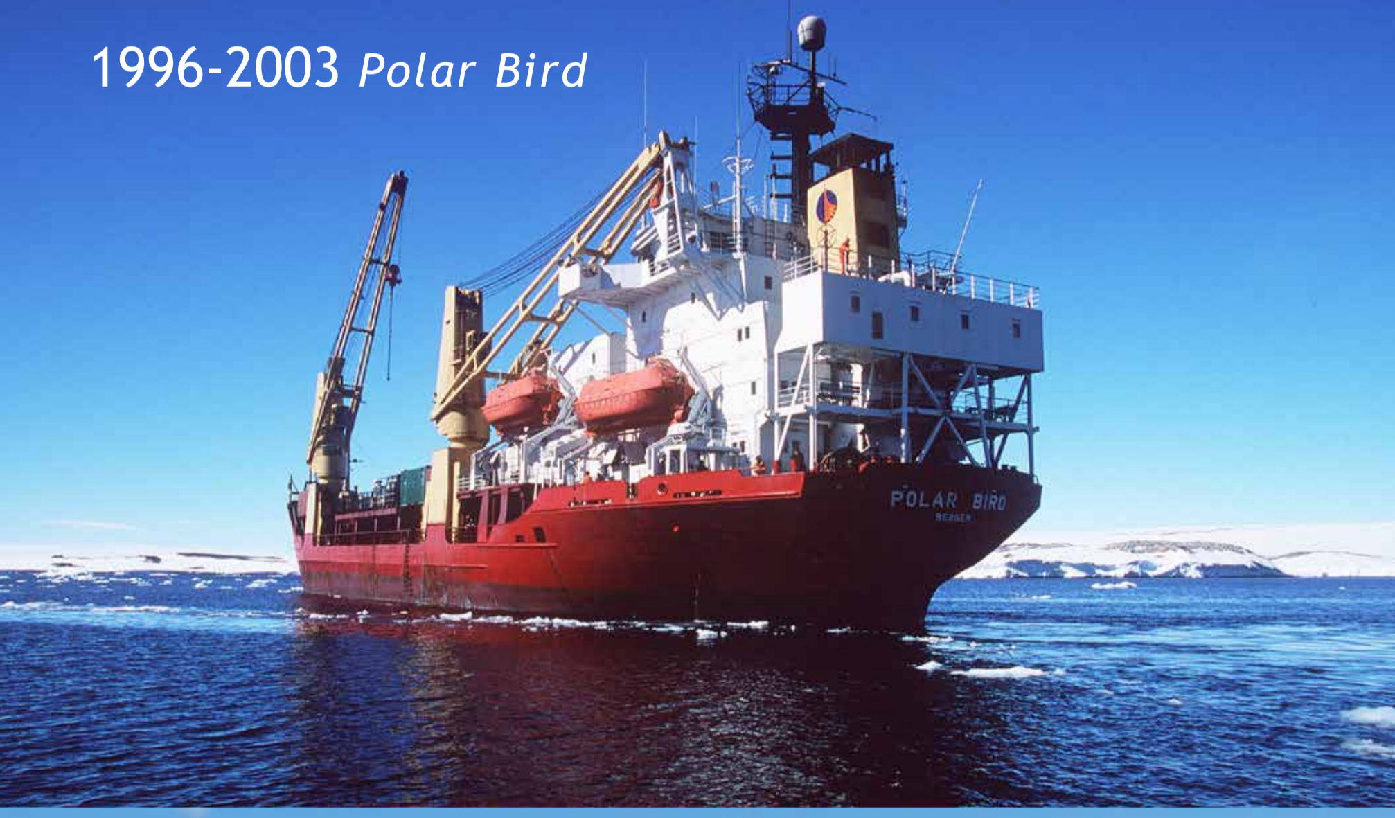
1996-2003 Polar Bird