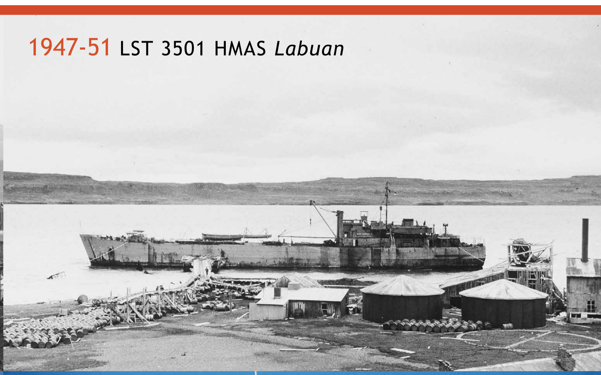
1947-51 LST 3501 HMAS Labuan