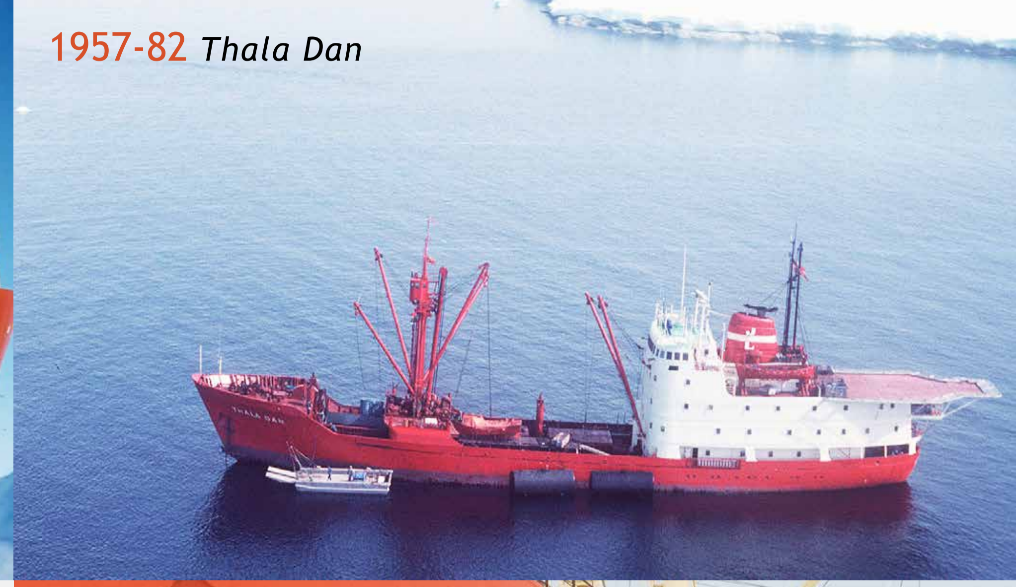
1957-82 Thala Dan