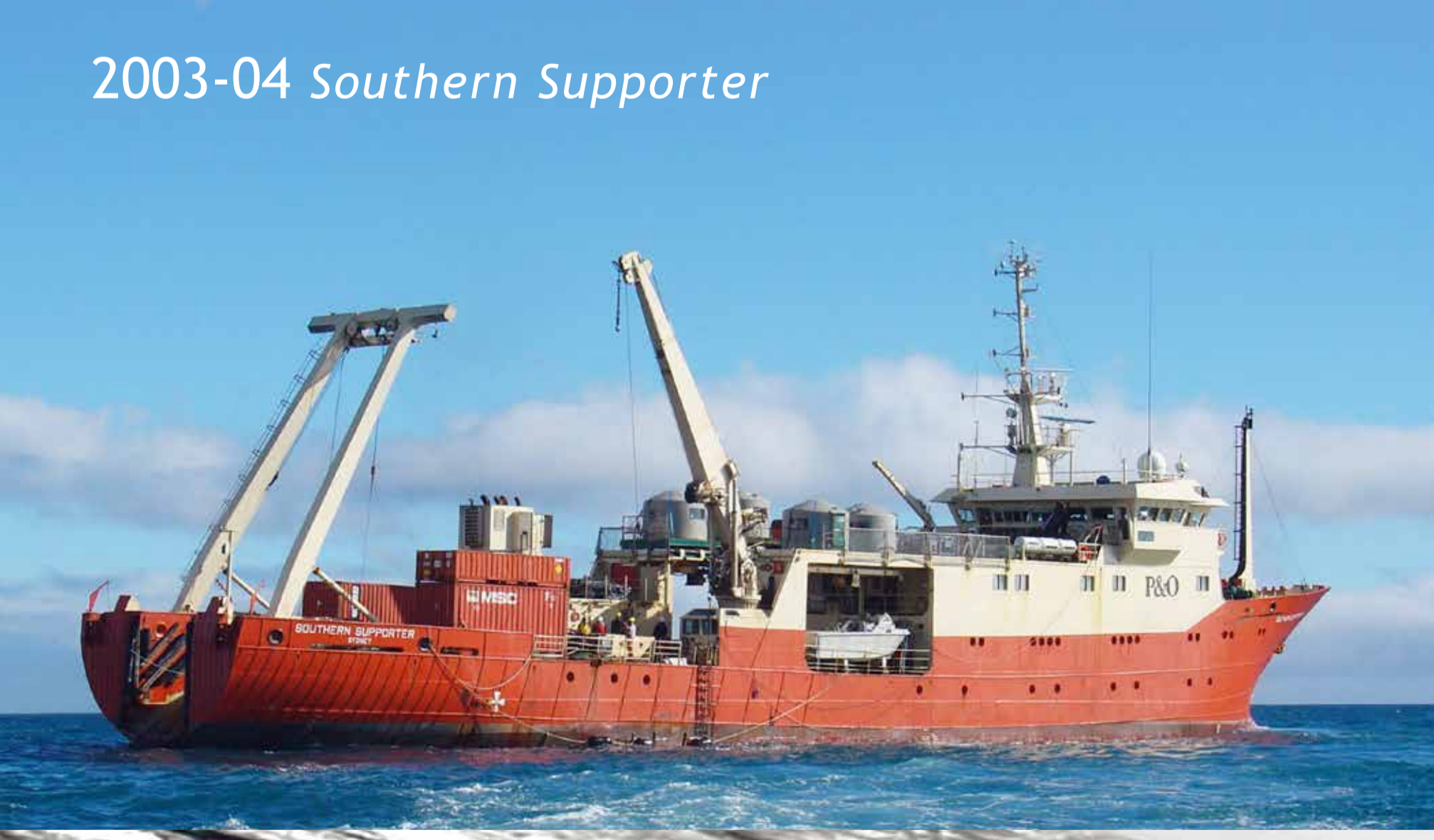
2003-04 Southern Supporter