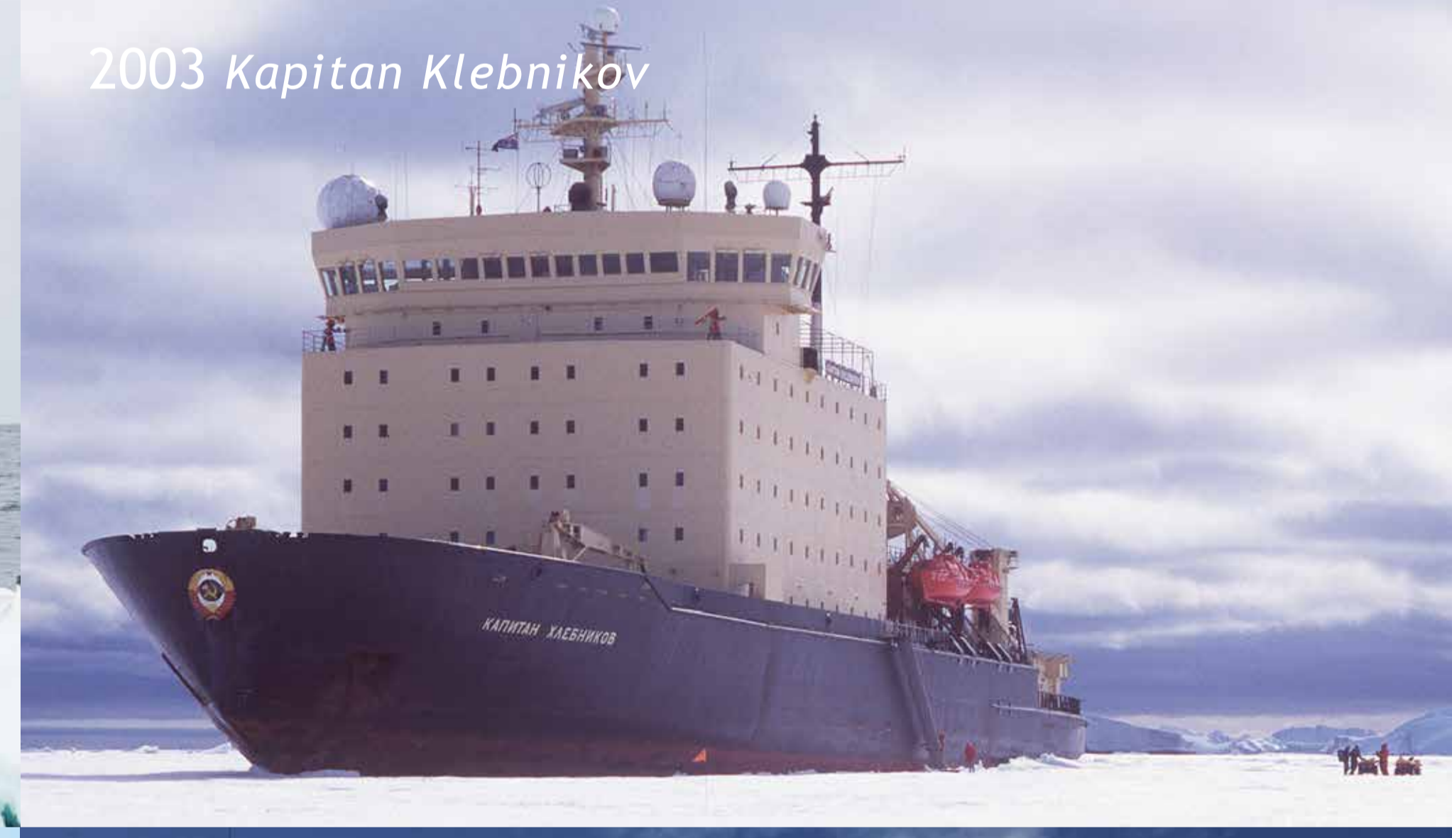
2003 Kapitan Klebnikov