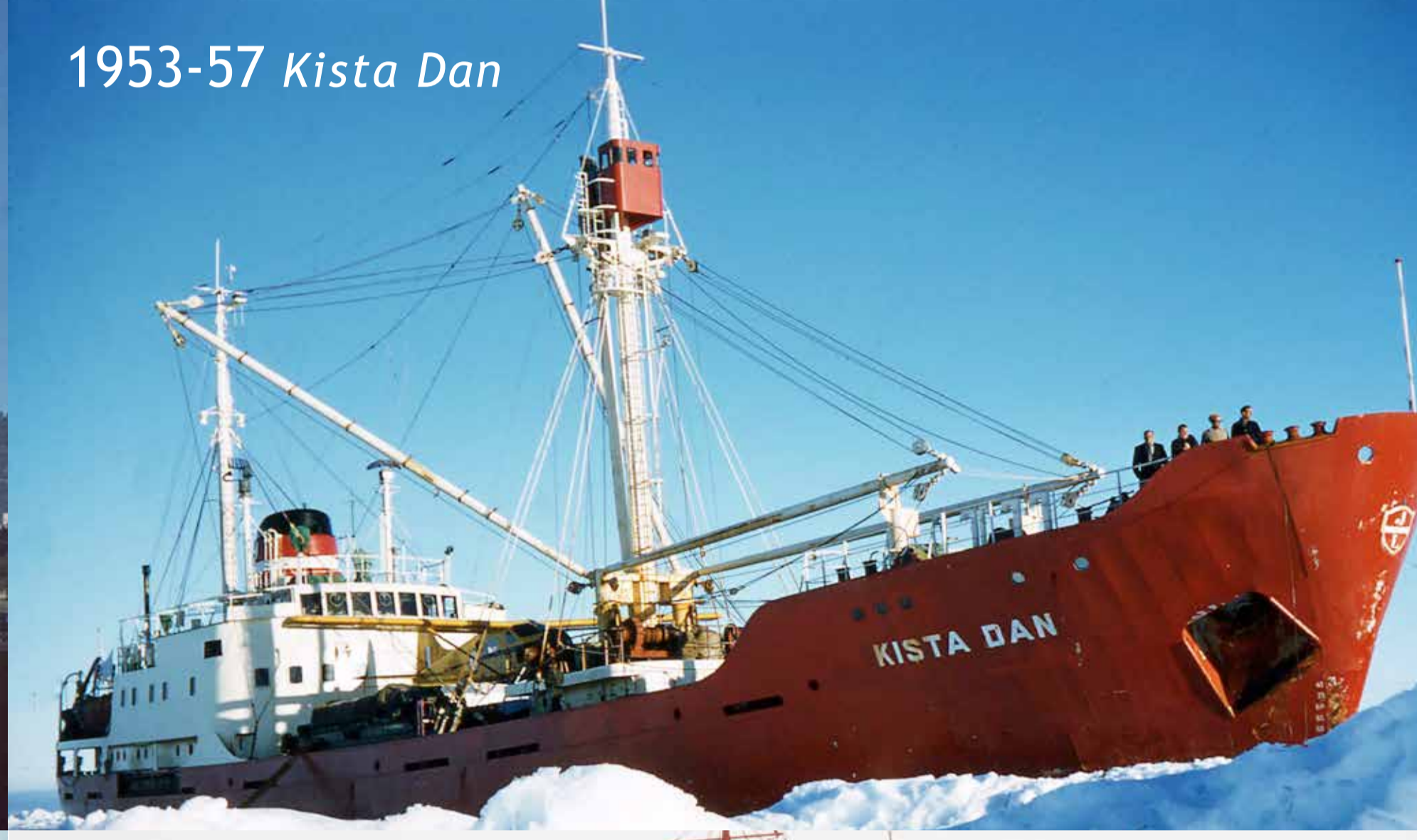
1953-57 Kista Dan