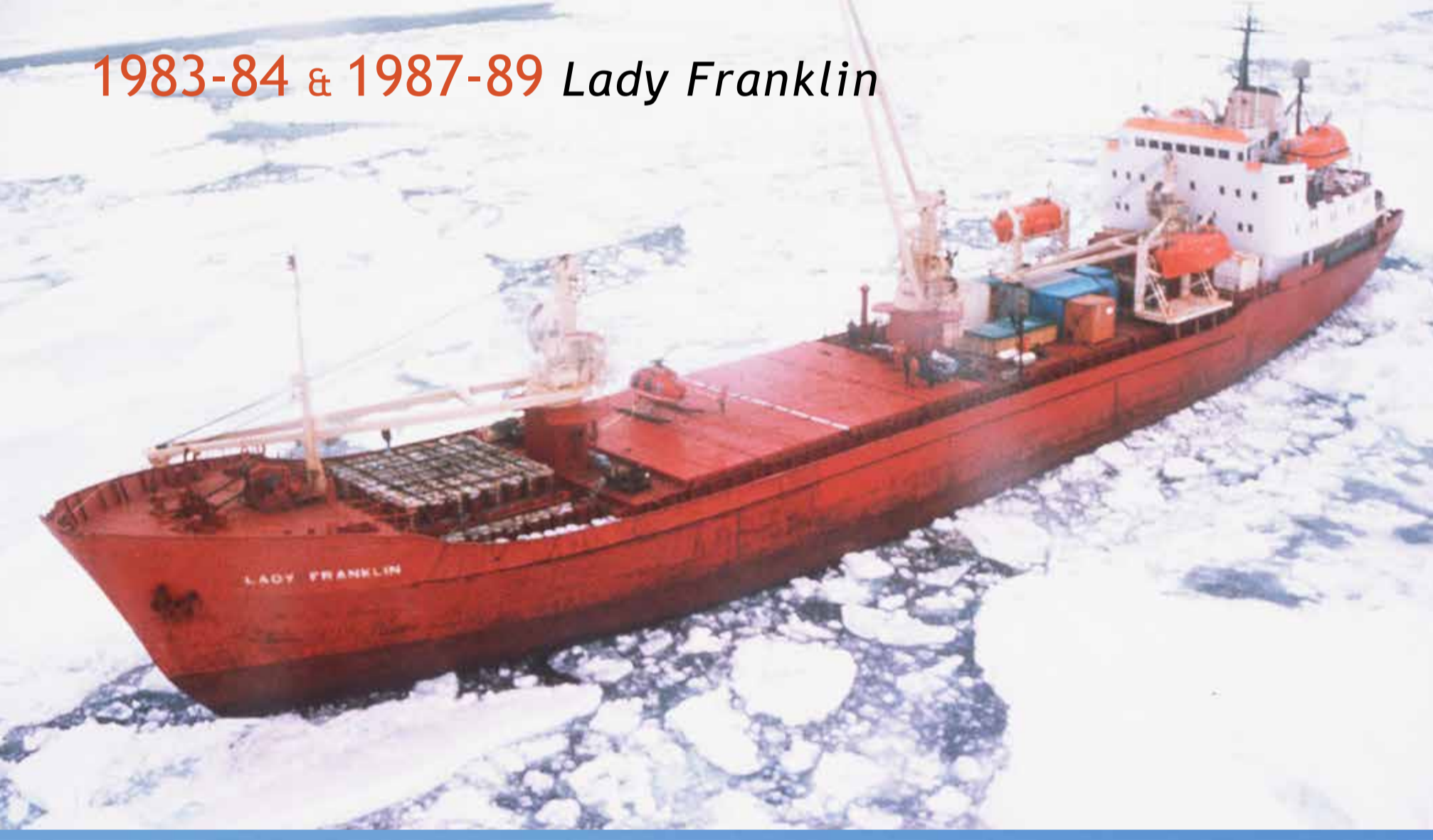
1983-84 & 1987-89 Lady Franklin