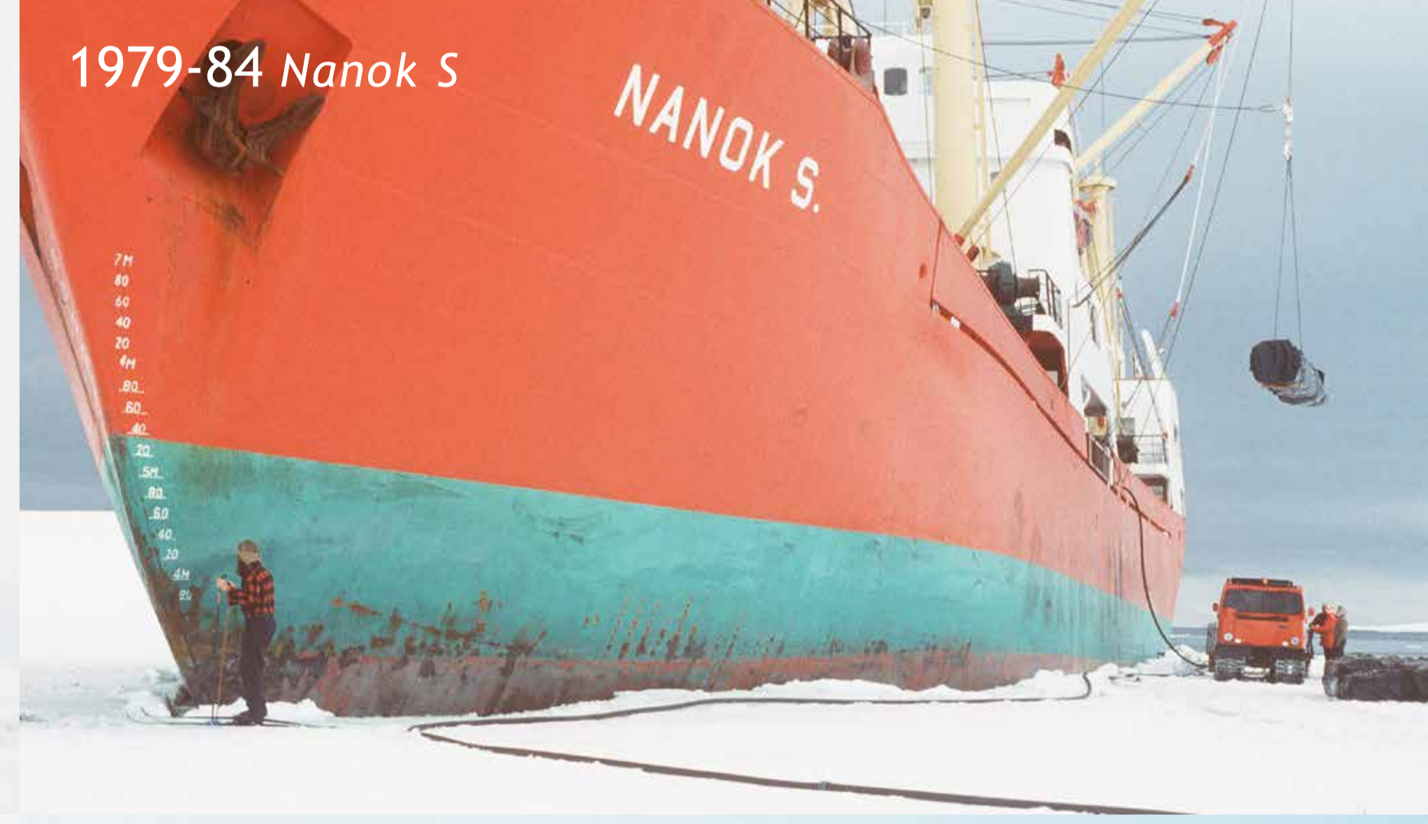
1979-84 Nanok S