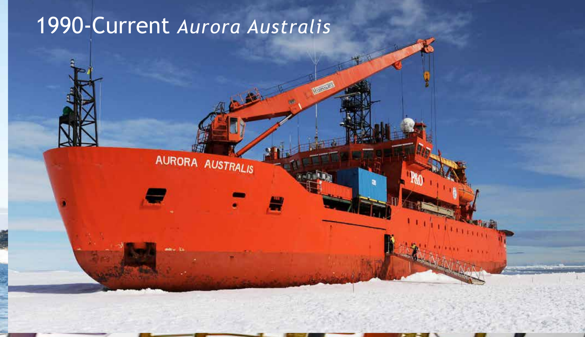
1990-Current Aurora Australis