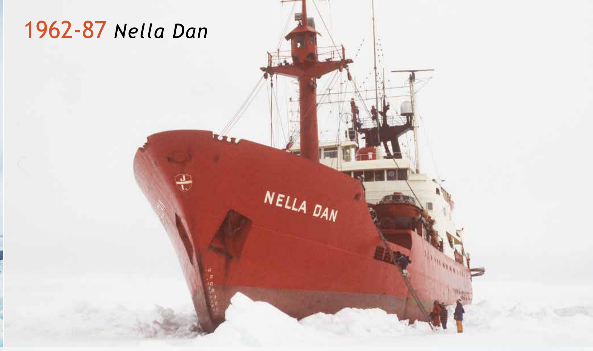
1962-87 Nella Dan