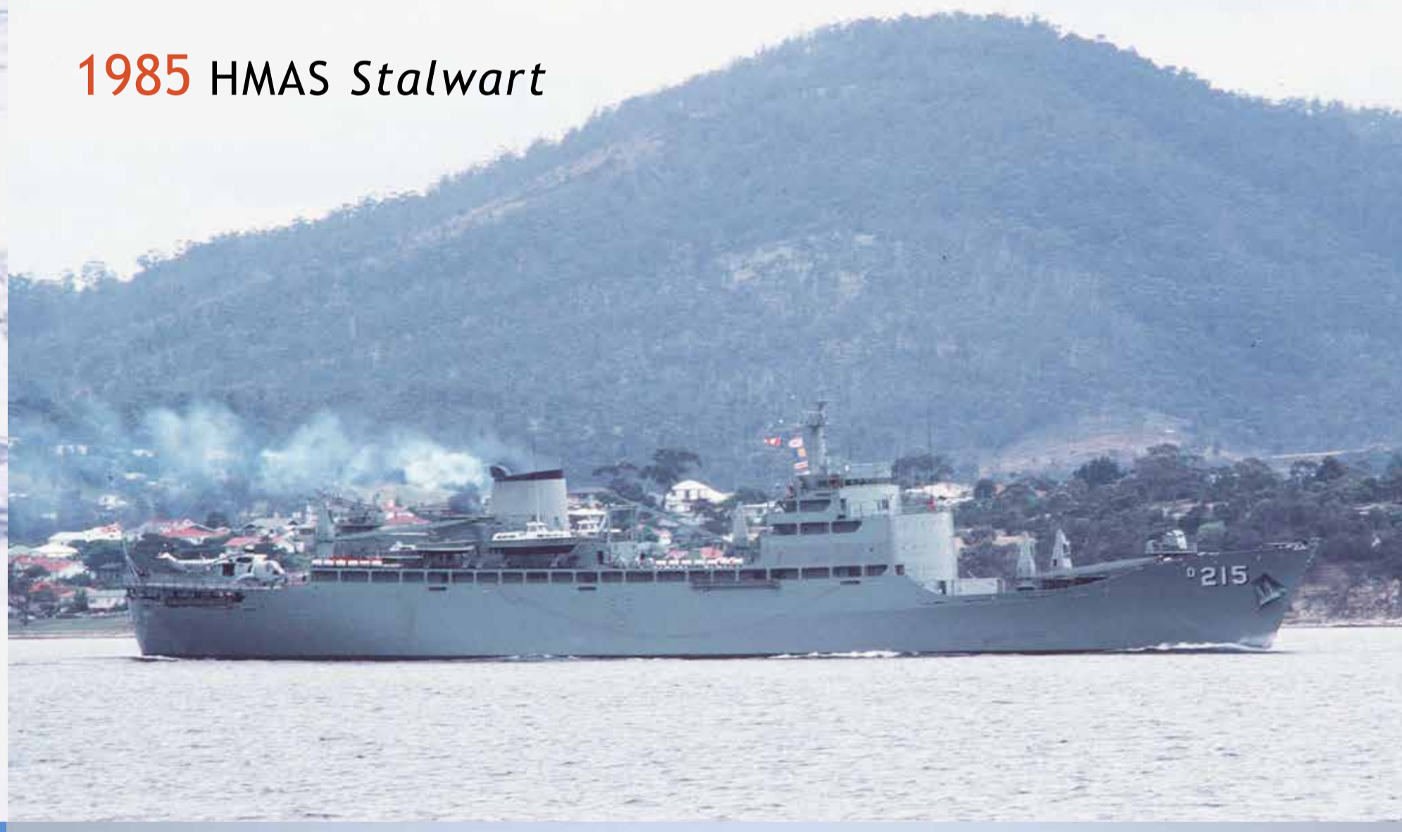
1985 HMAS Stalwart