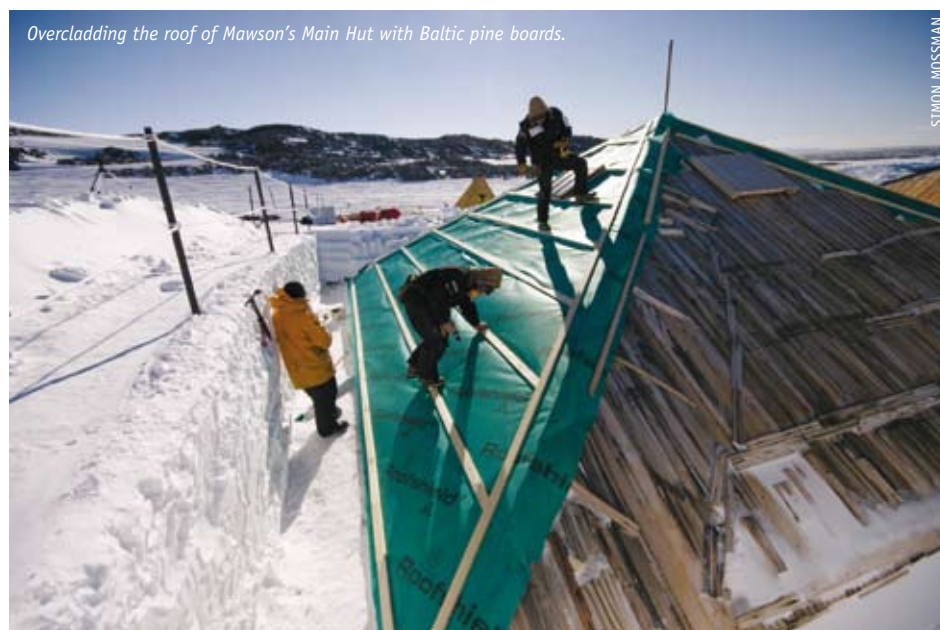
Overcladding the roof of Mawson's Main Hut with Baltic pine boards.

A six-man conservation team spent Christmas 2006 finishing a major task in the ongoing restoration and conservation of Mawson's Huts at Cape Denison.