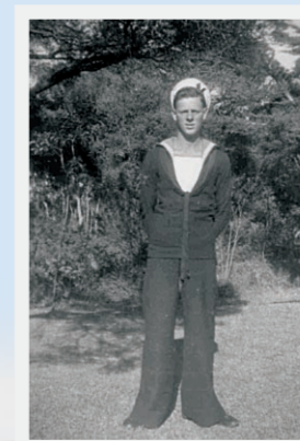
'At 18 I thought I was a man, but as you can see I was a boy. I was very proud of myself in my uniform. Today our fine young men and women are allowed to go out in civilian clothing. This privilege came in the last months of my service. It is great to be able to do that, but it would be nice if certain days were put aside for them to wear their uniforms so that we could see them and be proud.'