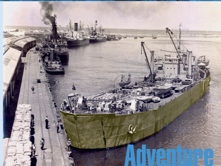
The HMALST 3501, later named HMAS Labuan , was built in Canada in 1943. The 2300 tonne naval vessel served in World War II before joining the Australian Navy. Her first ANARE voyage was to Heard Island, delivering Australia's first winter contingent on 11 December 1947. Far from comfortable, when heading into a sea she was described as being like a caterpillar in motion, rippling from bow to stern. The noise was deafening, with bulkheads buckling in and out with loud cracks, while the rivets creaked and groaned. On 16 December 1948 the ship was renamed HMAS Labuan and painted yellow for Antarctic service. She completed seven voyages with ANARE before being withdrawn from service after suffering severe damage when returning from Heard Island in 1951.

remove one and roll it down to the starboard waste for use in the engine room. I worked alone, while the seamen worked in teams. Their work was mostly on the dangerous fore deck and most of my time was spent on the quarter deck.