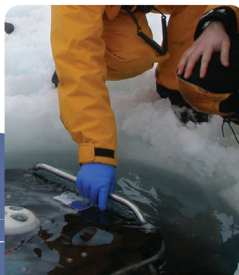
This autonomous underwater vehicle can measure sea ice thickness.