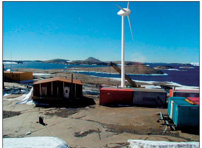
Photomontage view from the Red Shed at Mawson following installation of the first turbine.

The Mawson wind turbine system will rank among the world's most innovative, including the installations at Windy Hill, Queensland, and Denham in Western