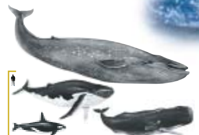
SIZING UP THE SUSPECTS