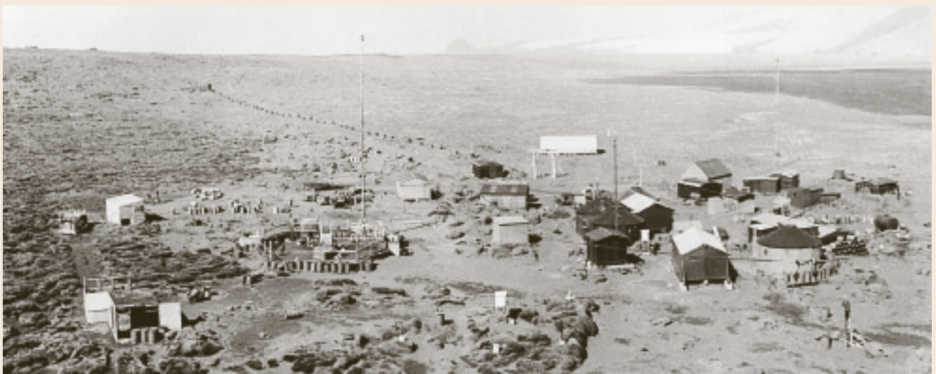
The ANARE station at Heard Island in 1951—at its maximum extent. The dog pen and dogs can be seen at left.