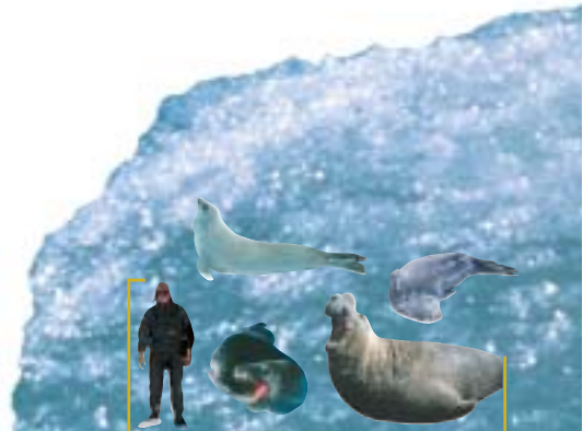
SIZING UP THE SUSPECTS