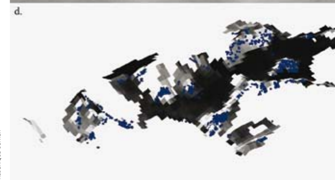
Three-dimensional view of the location of snow petrel nests in the Rumdoodle area (Framnes Mountains) of Mawson. From top to bottom: (a) Survey sites (green); (b) GPS observations of snow petrel nests (blue points); (c) nest observations (green points); (d) the predicted location of nests (in blue) generated by the model, based on environmental parameters – probability of nest presence ranking from low (black) to high (white).

Snow petrel nests are well concealed and usually surrounded by snow and an oily spit which accumulates at the top of the nest site and helps to scare predators.